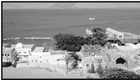
The sea of Galilee

greatest barometer through which the society would gauge their worth. This was owing to the fact that the invited guests often had to forfeit their daily vocations at home and trek from far afield in order to grace a function of that nature.