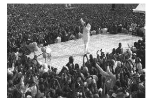
The mighty 2-million plus Repentance Gathering in Nakuru-Kenya at which the release of the BLACK HORSE and the prophecy on the impending global economic crisis and famine, was pronounced. The meeting took place on Saturday, August 23rd and Sunday, August 24th, 2008. This was exactly twenty-three days prior to the fulfilment of this prophecy. On September 15th 2008, Lehman Brothers filed for bankruptcy in an act that sent the financial markets tumbling across the globe.

From this scripture, it is overtly evident that in that August 19th 2008 vision, the unveiled creature with the face like man that emerges from the throne of God, is the third living creature. It is this third living creature around the throne of God that releases the BLACK HORSE. And that became the main reason as to why God the Father deliberately orchestrated an encounter between this third living creature and myself,