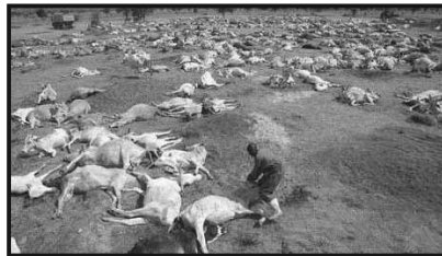
Kenya 2009 DROUGHT

In that Matthew chapter 24 Olivet prophecy , Jesus most assiduously conferred to his disciples that; 'there would be earthquakes and famines in various places', as the beginning of birth pangs dawn. This essentially denoted that when the advent of his return would draw nigh, there would not only be the onset of many FAMINES in different places, but also several repeating cycles of devastating FAMINES across the earth. Moreover, a fastidious appraisal of this central Mt. of Olives prophecy, beautifully unveils a greater insight into what exactly the LORD meant, when he referred to 'various places'. In a practical sense, the LORD Jesus was actually referring to such FAMINES occurring in many places with an increasing frequency across the whole world. And rightfully said, the LORD was already forewarning then, that many nations would be severely affected by this food shortage, and yet not all places would be afflicted. That was the main reason as to why