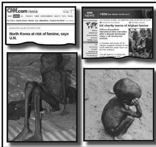
Kenya 2009 famine

under a bread cloth that ensured it was preserved hot. Eating the cheese involved breaking a piece of the pita bread, and using it to scoop a piece of cheese , but, it always carried with it a significant amount of oil that equally soaked the pita bread to softness. Any meats that were served at that table would be, but side dishes. In this way therefore, the wealthy always had cheese and wine at the table. It became a symbol of plenty in that society.