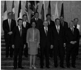
G8 Summit meeting in Italy

church, and revealed to her the signs of his coming in Matthew chapter 24, the unveiling of that most important prophecy later became embedded in the book of Revelation. Consequently, it is of utmost significance for the church to be able to connect the spiritual dots between the complex elements at the throne of God Almighty, and the ultimate Coming of the Messiah . Of the seven seals that define the prophetic timeline, only the first four are most critical to the church of Christ. These first four seals are most significantly crucial to the church because they relay the prophetic timeline towards the return of the LORD in the rapture . Only the Lamb of God has the authority to unlock the seven seals that define the prophetic timeline of God. There is a corresponding relationship that interplays between the opening of the scroll and the four living creatures around the throne of God.